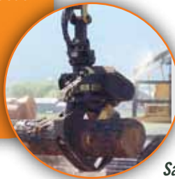
Saw ready rotator

STURDY ROTATOR HOUSING ◆ High strength steel casting