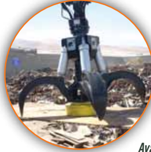
Available for electromagnet