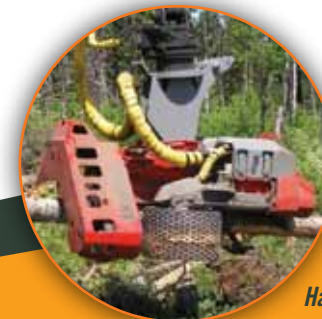
Harvesting head continuous rotation available