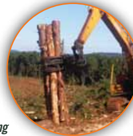
Resistant to side loading