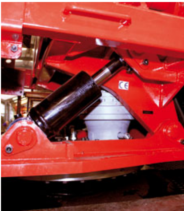
2 powerful hydraulic cylinders control the levelling of the bundler on steep terrain