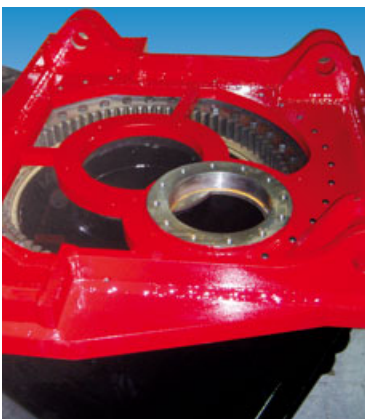
Continuous and unlimited rotation, with 2-stage rotation reducer and oil-bath negative brakes.